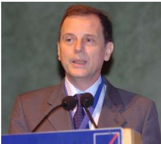
Prof Alberto Albanese

COST is one of the longest-running European instruments supporting cooperation among scientists and researchers across Europe. It is an intergovernmental framework of 36 countries for European cooperation in these fields, allowing the coordination of nationally-funded research on a European level. It is not an EU organisation, but has close contacts with the European Commission.