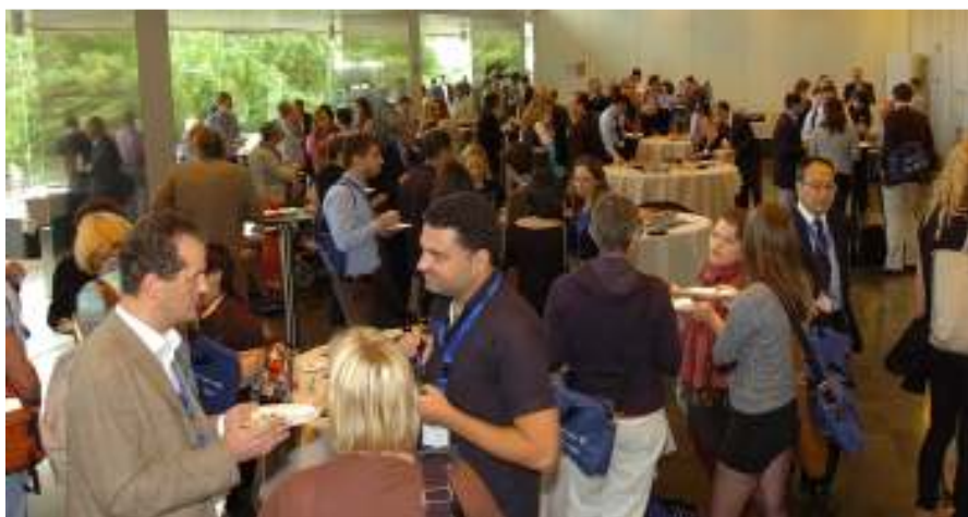
The Symposium lunch network, AXA Auditorium